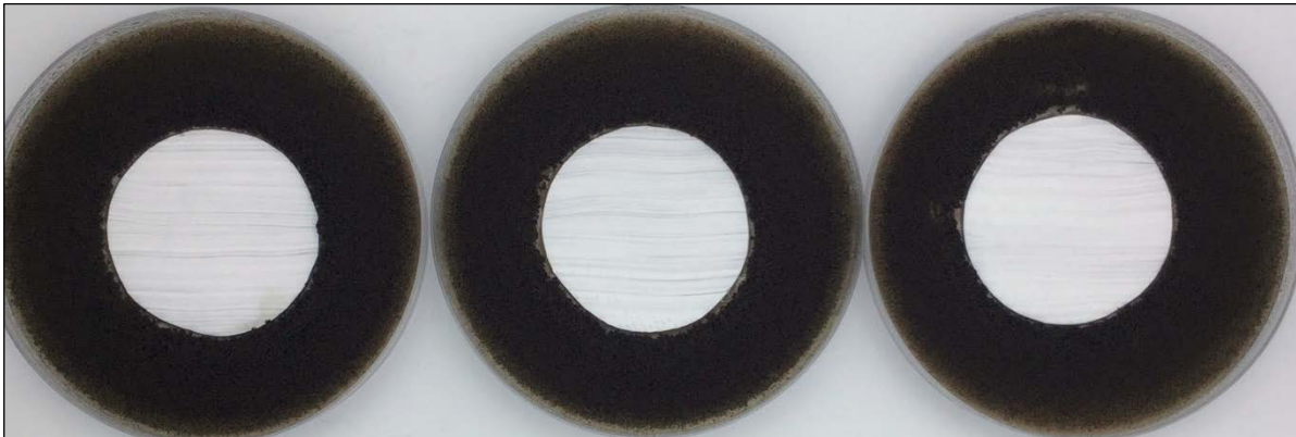
Replicate 3 - Rating: 0