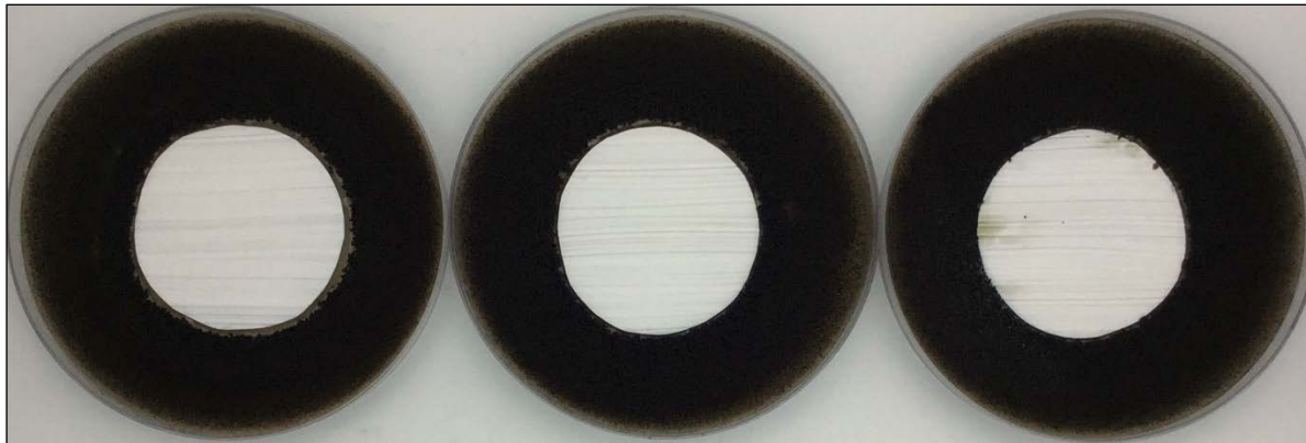
Replicate 3 - Rating: 0

The dark areas visible on Replicate 3 are non-viable inoculum.