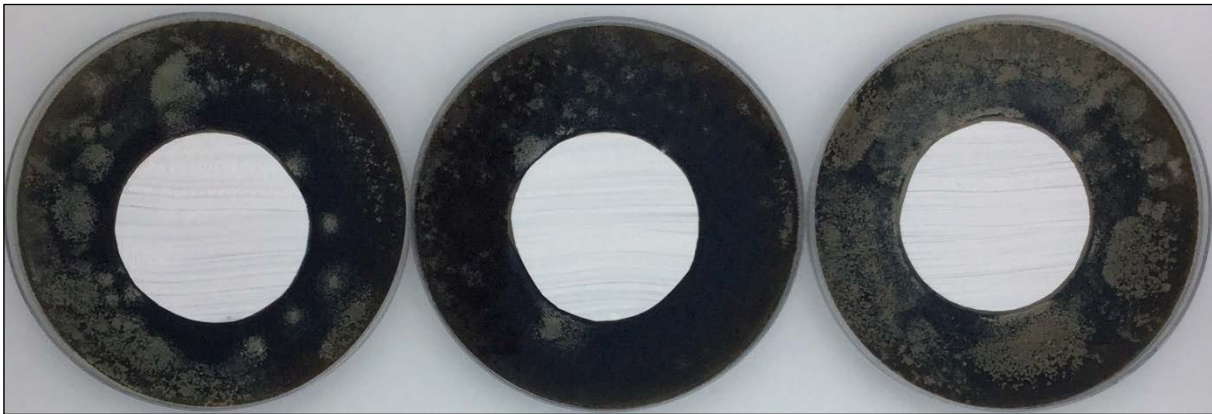
Replicate 3 - Rating: 0