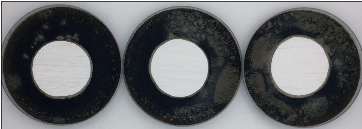
Replicate 3 – Rating: 0