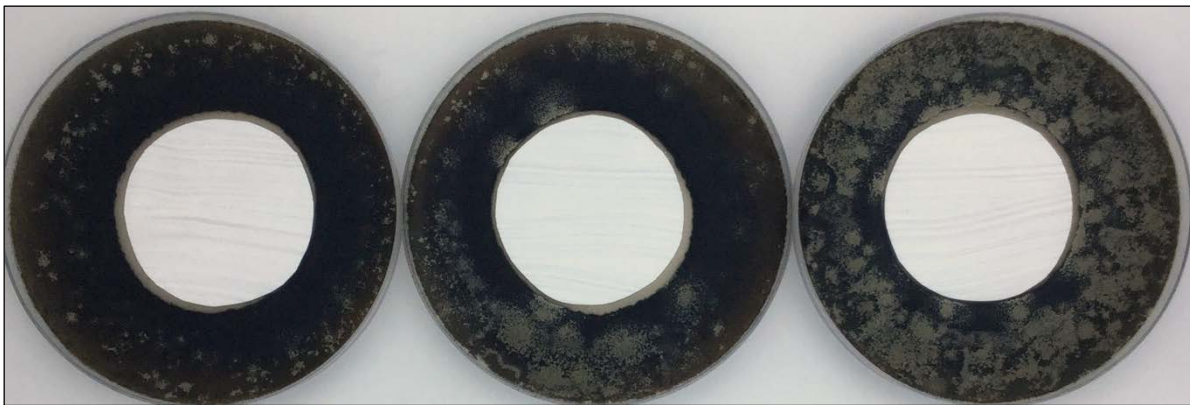
Replicate 3 - Rating: 0