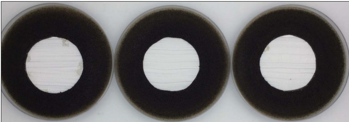
Replicate 3 – Rating: 0

The dark areas visible on Replicates 1 and 3 are non-viable inoculum.